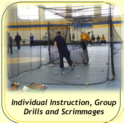
Individual Instruction, Group Drills and Scrimmages

*Players will be separated by age, experience and ability.