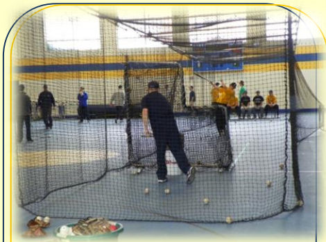
Individual Instruction, Group Drills and Scrimmages

*Players will be separated by age, experience and ability.