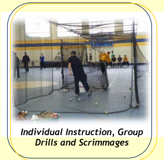
Individual Instruction, Group Drills and Scrimmages

*Players will be separated by age, experience and ability.